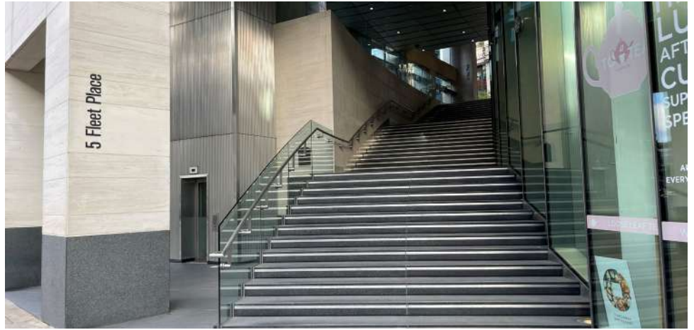
Accessible lift via Farringdon Street – located on the left of the stairs.