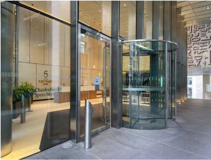
Push button automatic door - via the main entrance