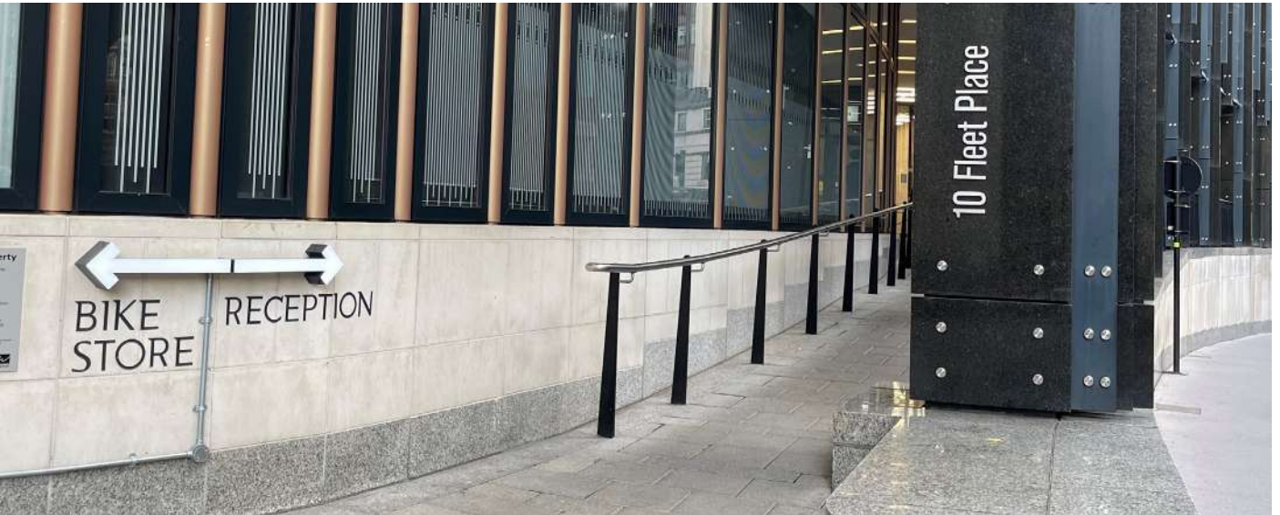
Step free access via Limeburner Lane – please turn left at the end of the ramp to access 5 Fleet Place.