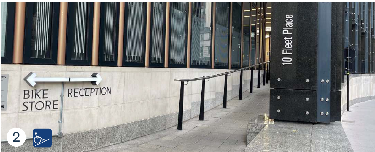
Step free access via Limeburner Lane – please turn left at the end of the ramp to access 5 Fleet Place.